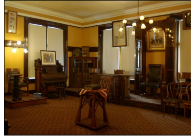
Capt. Thomas Espy Post No. 153 Grand Army of the Republic

In addition to housing a fine community library and acoustically superb music hall, the “Carnegie Carnegie” is home to a true national treasure — the Capt. Thomas Espy Post No. 153 of the Grand Army of the Republic. The Post has been documented as perhaps the most intact GAR Post in the country. At one time there were close to 7,000 posts from Portland, Maine to Portland, Oregon. The Espy Post was meticulously restored in 2010 to its turn of the last century condition.